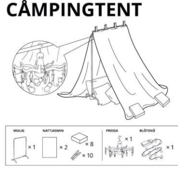
ake sure that the structure is safe. Do not leave children unattended re suggested examples are not oficial REA user guides for IREA product you didn't find products mentioned in the instruction, use similar ones.